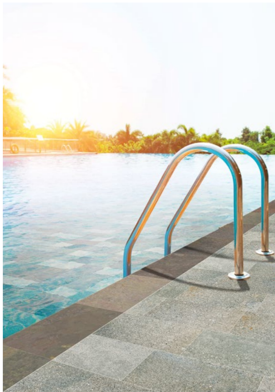
Interno piscina Ocean Nicobare Nut 15x15 Esterno piscina Ocean Nicobare Nut 30x60 Antislip R11 / Ocean Bali Grey 30x60 Antislip R11